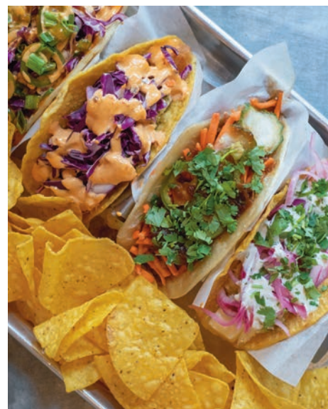
L-R: HOLY KALBI, AMY HATES FISH, BANH MIJO and LEBANESE BLONDE .

The LEBANESE BLONDE ($4.90) is a vegetarian taco that uses juustoleipä cheese as the primary protein. To bring it all together, it also has a citrus tabbouleh, pickled red onions and a creamy cilantro sauce. This was the most unique taco that I tried. The overall combination of flavors was good, and the tabbouleh was especially tasty. The grilled juustoleipä, however, has a richness that isn't quite cut by the delightful pickled onions