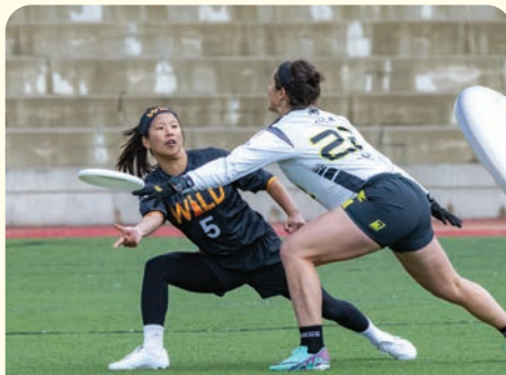
Utah Wild welcomes both women and nonbinary athletes as a way to push the body and soul through ultimate frisbee.